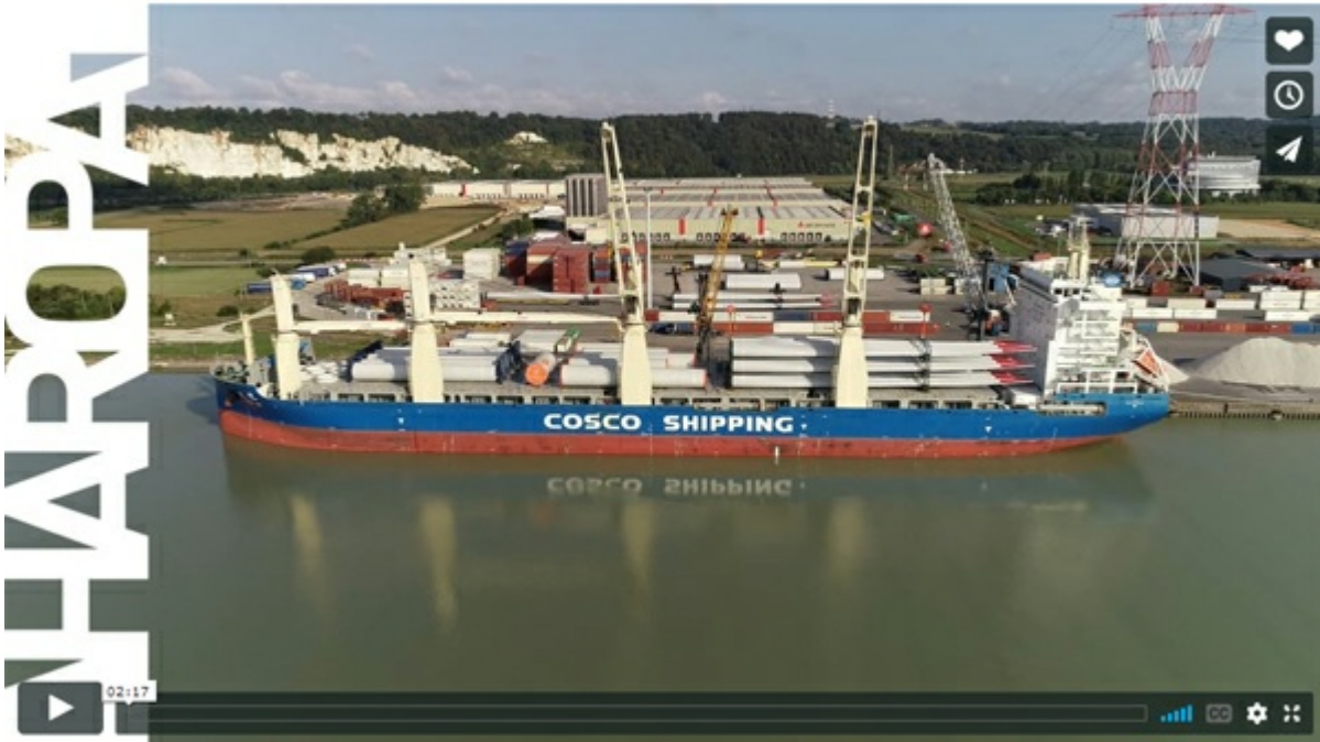
Route de l'artique

Retrouvez la route de l'artique en vidéo!